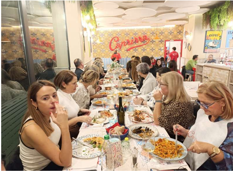
Day 1: Dinner time