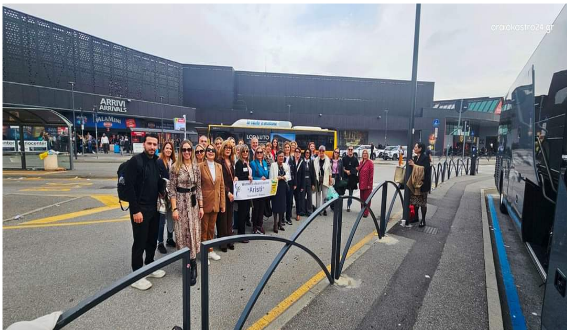
Arrival at the airport of Bergamo, Milano

Funded by the European Union. Views and opinions expressed are however those of the author(s) only and do not necessarily reflect those of the European Union or the European Education and Culture Executive Agency (EACEA). Neither the European Union nor EACEA can be held responsible for them.