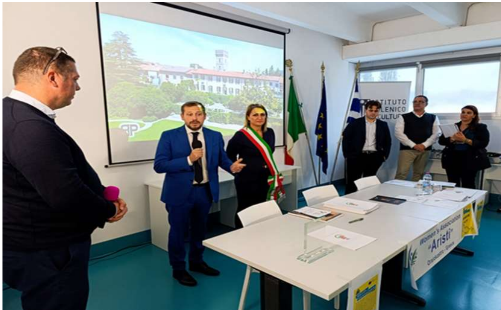
Emanuele Monti - Regional Councillor of Lombardy Region, addressing institutional salute