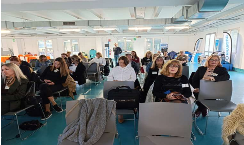
Day 2: members of Aristi Association attending the session