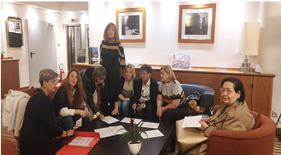
Off the record meeting at the conference room of the hotel

Funded by the European Union. Views and opinions expressed are however those of the author(s) only and do not necessarily reflect those of the European Union or the European Education and Culture Executive Agency (EACEA). Neither the European Union nor EACEA can be held responsible for them.