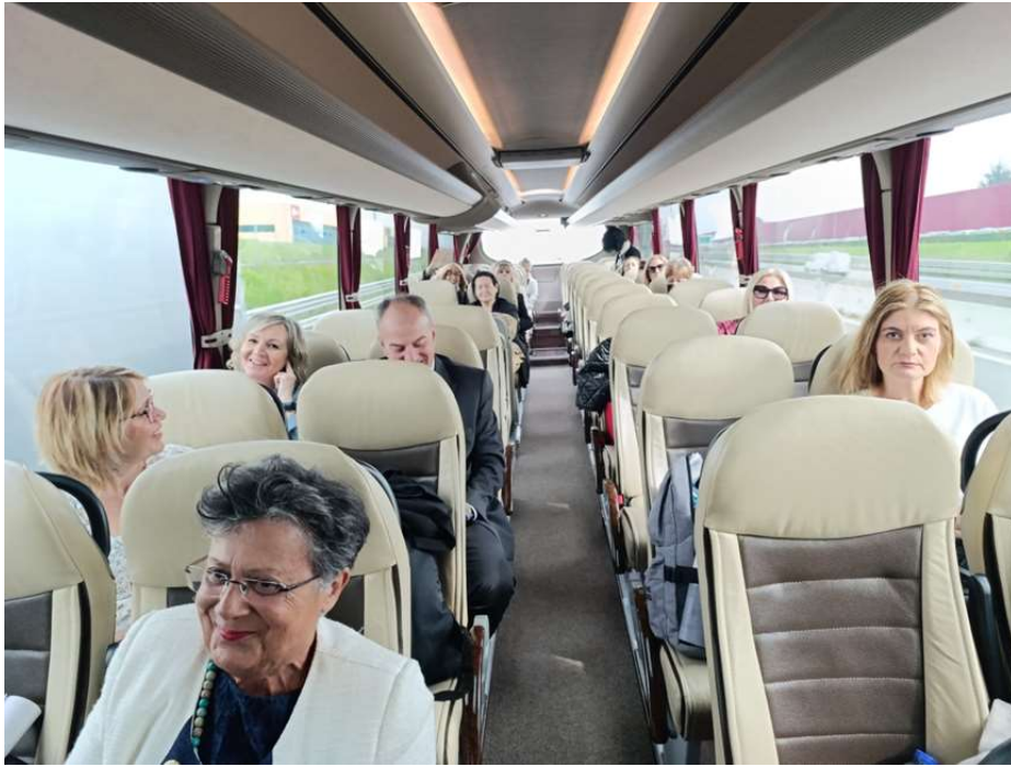
On the road to the Townhall of Municipality of Bodio Lomnago