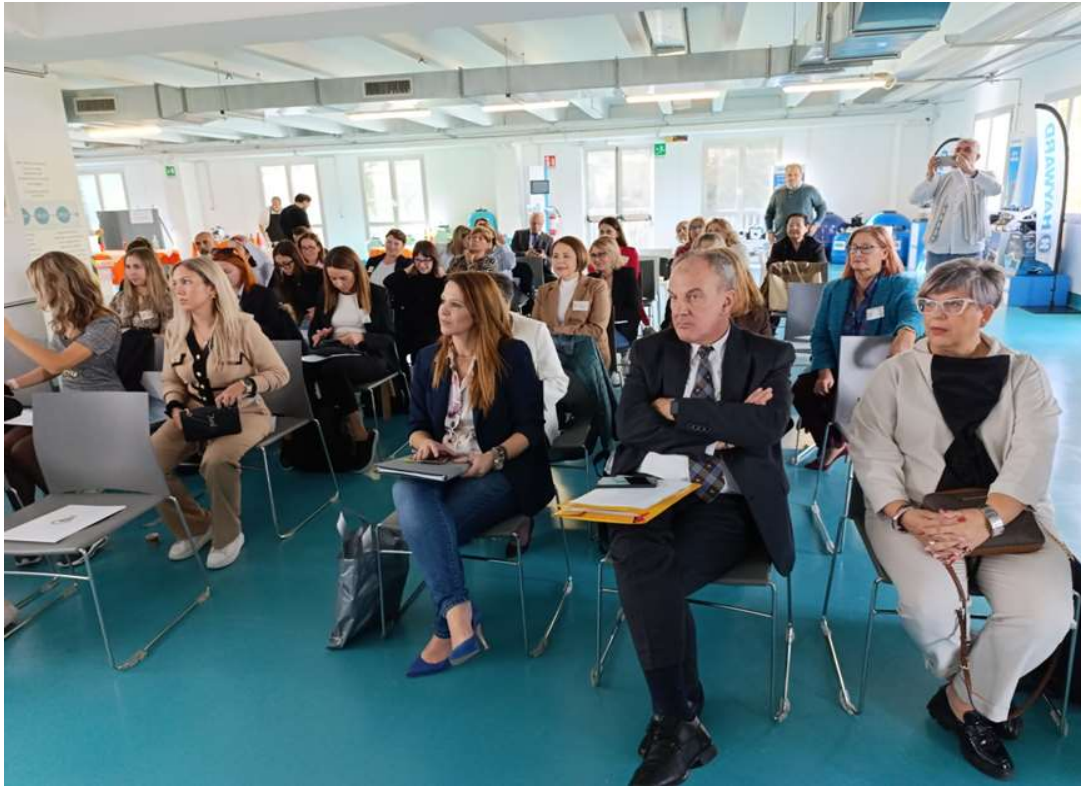
Day 1: Mentoring sessions