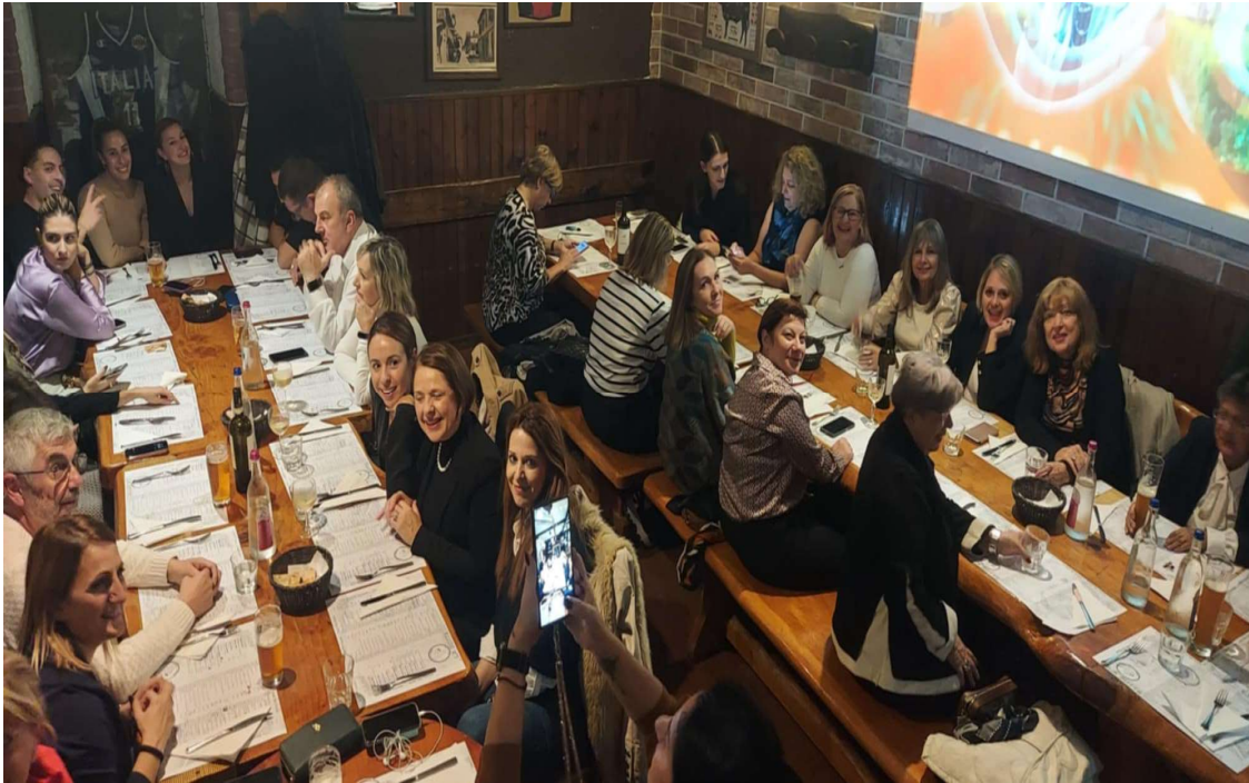
Day 2: Dinner time